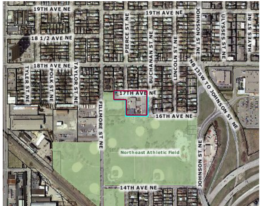
Hennepin County Property Info - 2004 Aerial Photos