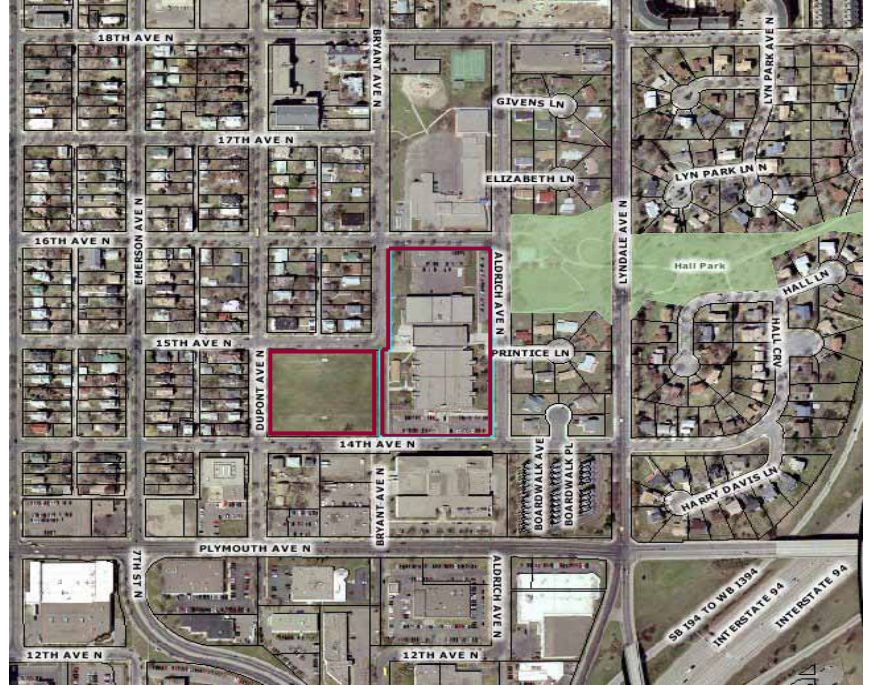
Hennepin County Property Info - 2004 Aerial Photos